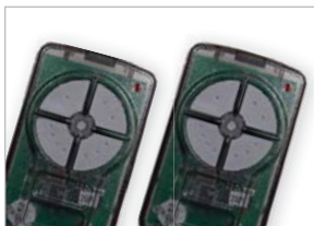
Two TrioCode™128 transmitters