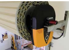
Opener with Battery Back Up