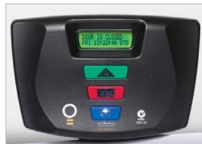
Wall Mounted LCD Control Panel